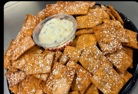
CANNOLI CHIP & DIP PLATTER