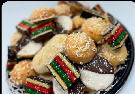
DELUXE ITALIAN COOKIE PLATTER