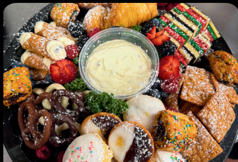
ITALIAN DESSERT CHARCUTERIE

BEAUTIFULLY HAND-CUT WATERMELON BASKET FILLED WITH MIXED CUT FRUIT & SEASONAL BERRIES