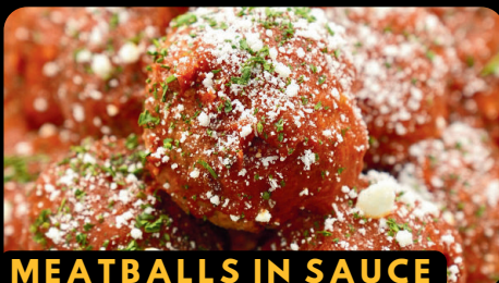
MEATBALLS IN SAUCE