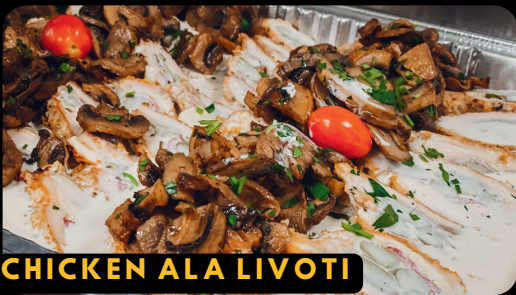
CHICKEN ALA LIVOTI

ALL WHITE MEAT CHICKEN BREAST STUFFED WITH ASPARAGUS, ROASTED PEPPERS, PROSCIUTTO DI PARMA & FRESH MOZZARELLA SERVED IN A BRANDY CREAM SAUCE WITH WILD MUSHROOMS