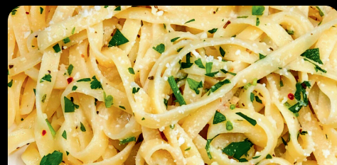
LINGUINE & WHITE CLAMS